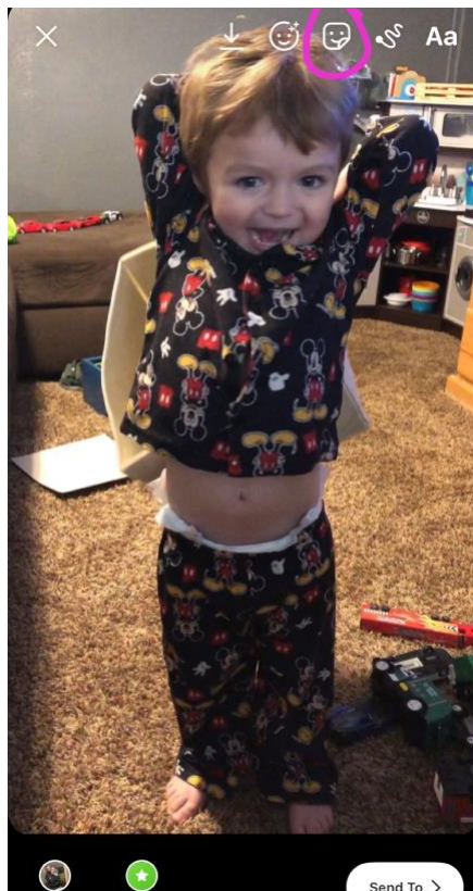
Step 6, Figure 1